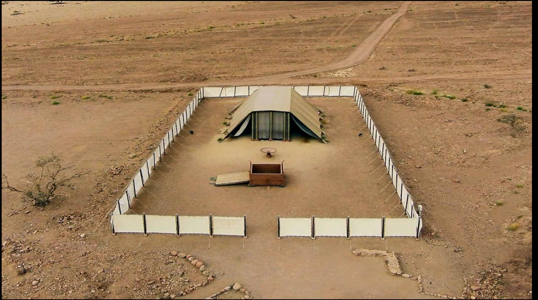
Model of the tabernacle at Timna Park in southern Israel